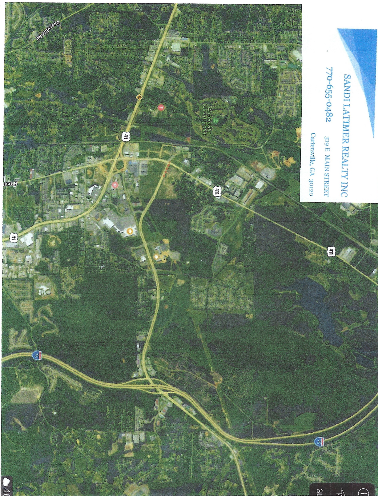
LOCATION MAP SHOWING PROXIMITY TO 1-75, HWY 20, HOSPITAL, SHOPPING AND HWY 411