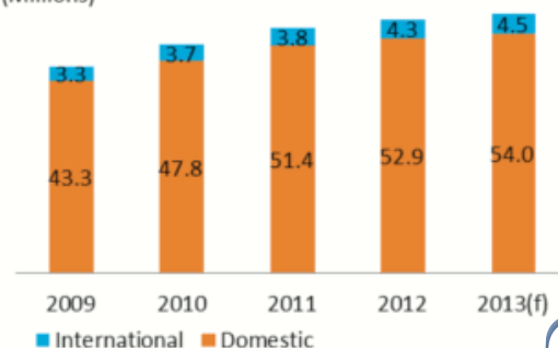
VISITOR VOLUME (Millions)

The Orlando International Airport announced a $1 billion expansion including a rail terminal for All Aboard Florida (service between Orlando and Miami), four new gates and other accommodations as the airport's current passenger volume of 35 million per year is anticipated to rise to 40 million by 2016.